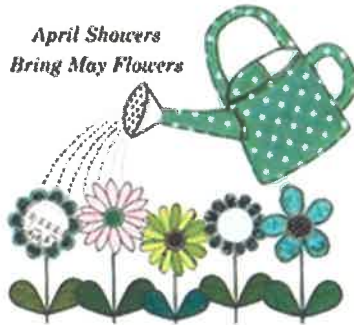
April Showers Bring May Flowers

EMAIL YOUR NEWSLETTER? Would you like to be added to our newsletter email distribution, or be notified of important happenings at St. John's? Email your request to: secretary@stjlutheran.org