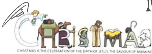
CHRISTMAS IS THE CELEBRATION OF THE BIRTH OF JESUS, THE SAVIOUR OF MANKIND